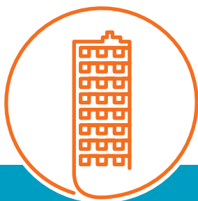
Professional, Medical & Financial

Get competitive rates and quick approval on Small Business Administration (SBA) 7A and 504 loans from an SBA Preferred Lender.*