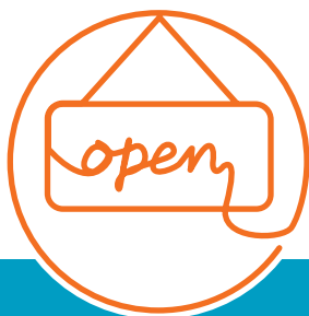
Retail Shops & eCommerce