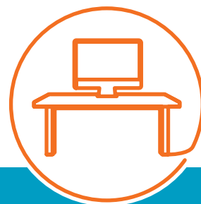
Home Office & Home Business

Benefits include longer maturities to improve your company's cash flow.