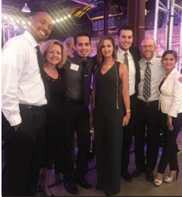
Candlelight Ranch - Annual Fundraiser