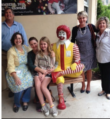
Ronald McDonald House