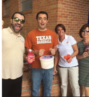
The Boys & Girls Club of America