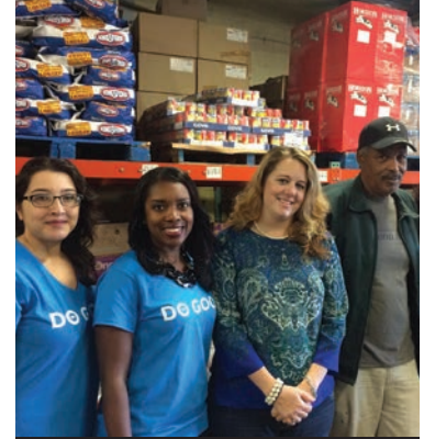
Galveston County Food Bank